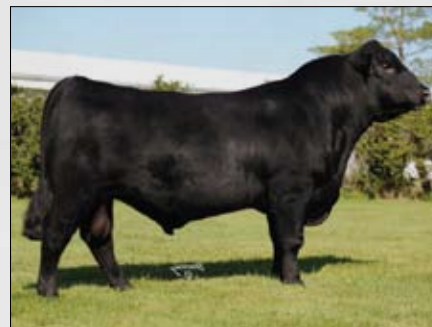
Werner War Party His progeny sells

The Saturday event also includes the sale of 150 outstanding registered and commercial Angus females. These females will