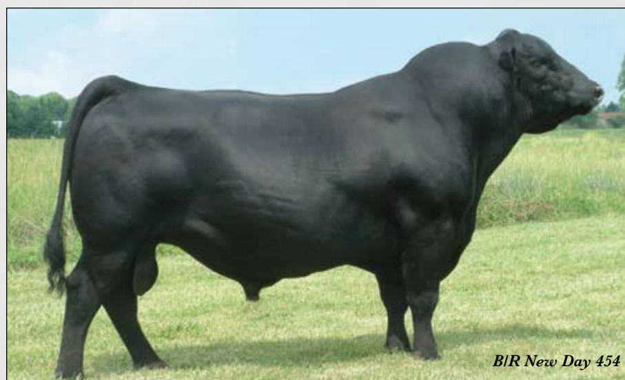
B/R New Day 454