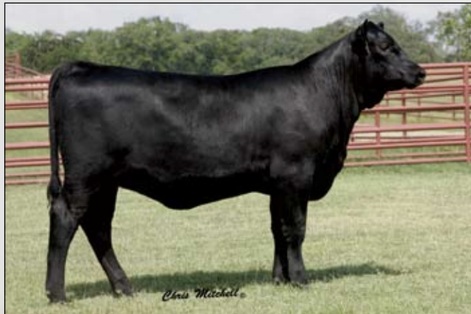
44 Ruby of Tiffany W927

180 Big, Stout Angus Bulls & 30 Red Angus Bulls to be Sold on October 23