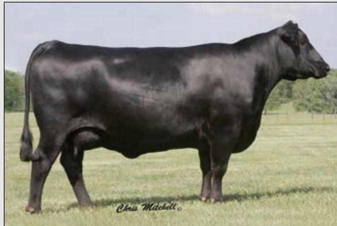
Selling 3 pregnancies out of B/R New Day 454 Dam B/R Ruby 1224

L ate October in Central Texas is about as good as it comes. Cooler weather will have arrived and one of the finest collections of Angus cattle will be offered at The Sale at 44 Farms. Please bring the ranch crew and the whole family for two wonderful days of good food, great friends and super Angus cattle at 44 Farms near Cameron, Texas.