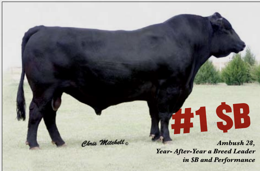
Ambush 28, Year-After-Year a Breed Leader in $B and Performance

44 Farms Cattle Again Lead the Class, Ambush 28 Continues Reign as $B King