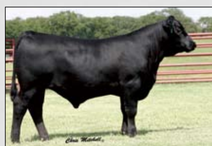
454 bull calf 44 Country X802, DOB 1-3-2010

454 is owned with Wiederstein Pure Angus, Audubon, Iowa. Semen can be purchased by calling Select Sires, Inc. at 614-873-4683.