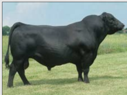
B/R New Day 454 His progeny sells

This bull sale offering includes 180 Angus bulls and for the first time, 30 Red